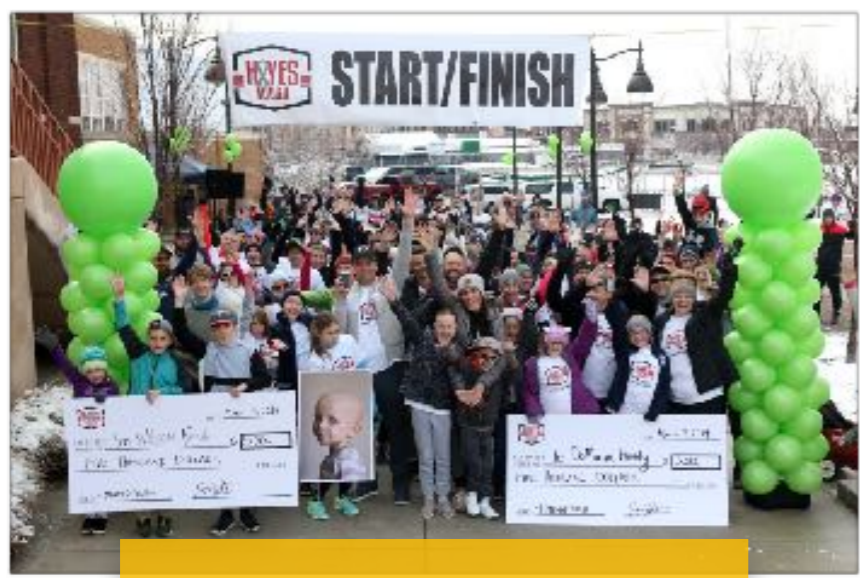
THE ANNUAL HAYESTOUGH 5K

Held every spring in Holladay, Utah to support 2 local warrior families as they battle childhood cancer. A family friendly event that involves the whole community here in Utah as well as those people that want to participate virtually from around the world.