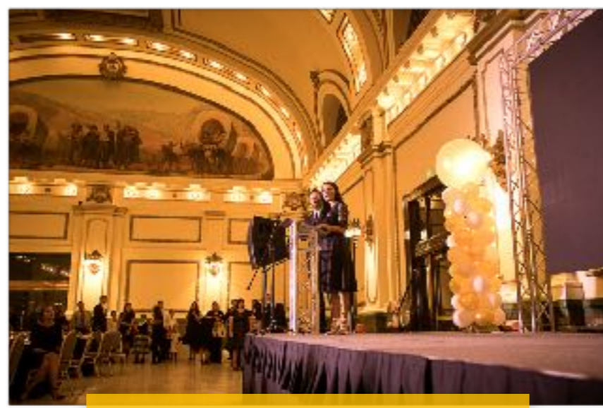
THE HAYESTOUGH DREAM BALL

Held every spring in Holladay, Utah to support 2 local warrior families as they battle childhood cancer. A family friendly event that involves the whole community here in Utah as well as those people that want to participate virtually from around the world.